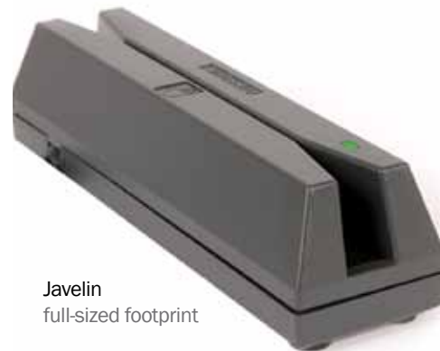
Javelin full-sized footprint