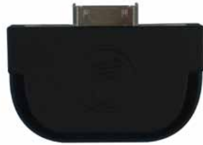
iDynamo Adapter kit available for iPhone 4, iPhone 3GS, iPhone 3G, iPad 2, iPad and iPod touch