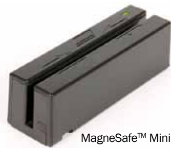
MagneSafe™ Mini standard footprint